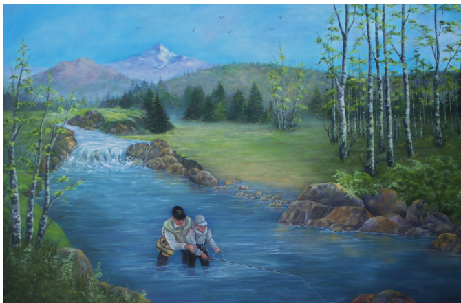
Created by VITAL participant Valeen T., Ocean Shores, WA